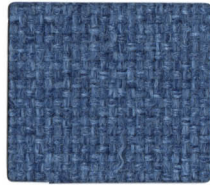
Ice Caves NBLE32