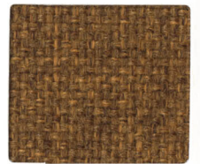
Queen Bee NBLE38