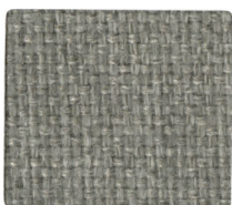
Windy Day NBLE43