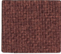
Desert Sand NBLE27